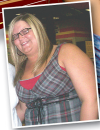
— Mackenzie Snap Fitness Member

in 30 days or your money back For details go to www.snapfitness.com/Lose