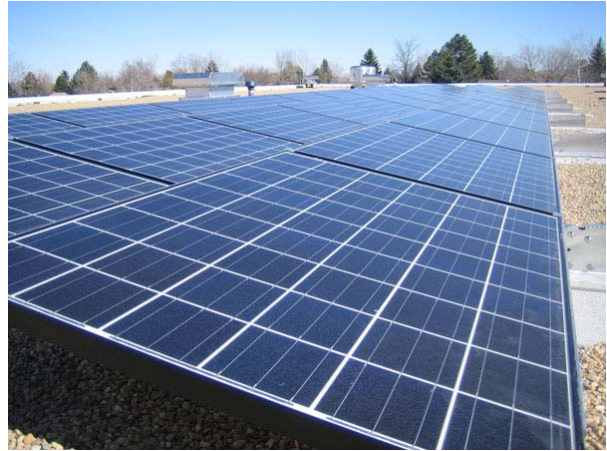
A 9.8 kilowatt photovoltaic system was installed on the roof of the new wing