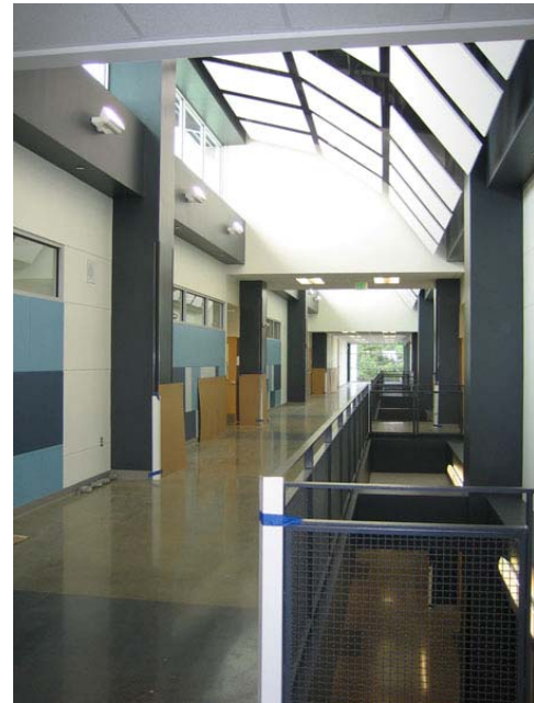
The building design maximizes daylighting.

Early in the design phase, the design advisory team held a sustainability workshop and identified as priorities very good daylighting and a courtyard with an outdoor learning component. Weidt Group performed an energy analysis to guide decisions related to choosing more efficient systems and products. In considering the energy efficiency of the building, the design team was guided by the idea that it is worthwhile to spend a little more on more efficient systems and equipment with shorter payback periods.