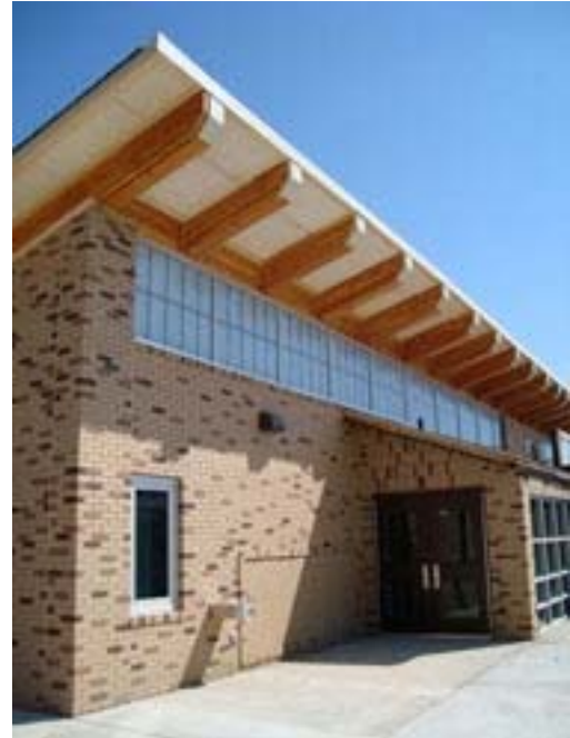
The classroom addition at Lafayette Elementary features ample