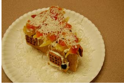
Graham Craker House from our November 19th TODOS event

The holiday season is supposed to be a time for family get-togethers and celebration. Most families look forward to this special time of the year. A time for renewal of the love and warmth that family represents. Too often, however, it becomes a time of family conflict and struggle. In the counseling industry, there is often a spike in referrals after school holidays. This is usually the result of underlying dysfunctional family dynamics flourishing in an environment of ongoing family interaction. Let's open our "Happy Holiday Family Survival Kit" and consider the following strategies: